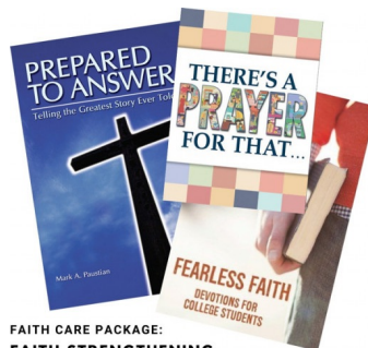
FAITH CARE PACKAGE: FAITH STRENGTHENING FOR COLLEGE STUDENTS

https://online.nph.net/faith-strengthening-for-college-students.html