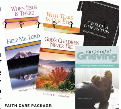
FAITH CARE PACKAGE: COMFORT WHEN GRIEVING

The six devotionals in this care package center on God's rich promises in times of grief. This care package provides a gentle way to send comfort to anyone suffering loss or going through a difficult time. $56 value for $34.99