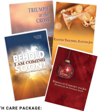
FAITH CARE PACKAGE:

https://online.nph.net/devotions-for-every-season.html