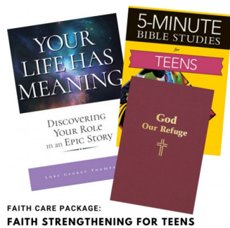
FAITH CARE PACKAGE: FAITH STRENGTHENING FOR TEENS

https://online.nph.net/faith-strengthening-for-teens-care-package.html